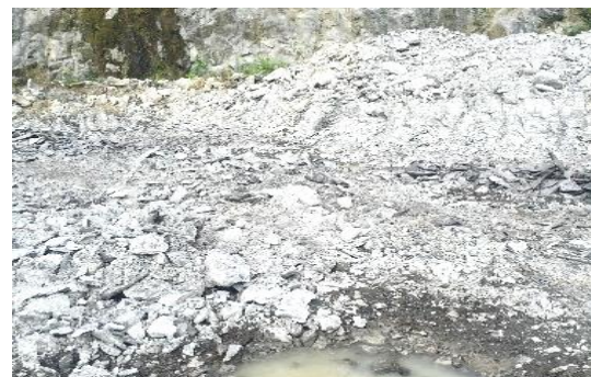
Fig. 1. Overboulder in its natural form.

In order to provides detail of materials used in the experimental study, laboratory investigation program was carried out to evaluate the basic properties and mechanical properties of the untreated soil and stabilized soil, in this case, soft soil stabilized by overboulder and cement. Soft soil was stabilized by cement and overboulder with presentation based to dry density of each mix. The Asbuton Overboulder material was brought from Buton Island and sampled at Lawele with coordinate 5 ° 13'53.56 "S and 122 ° 58'0.40" E.